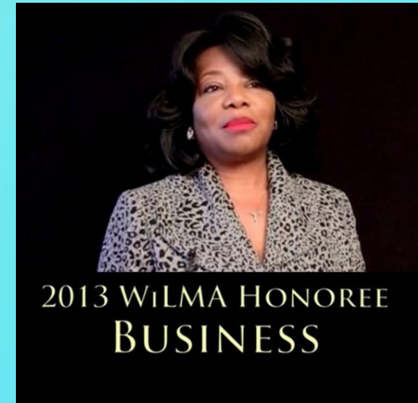
2013 WILMA HONOREE BUSINESS